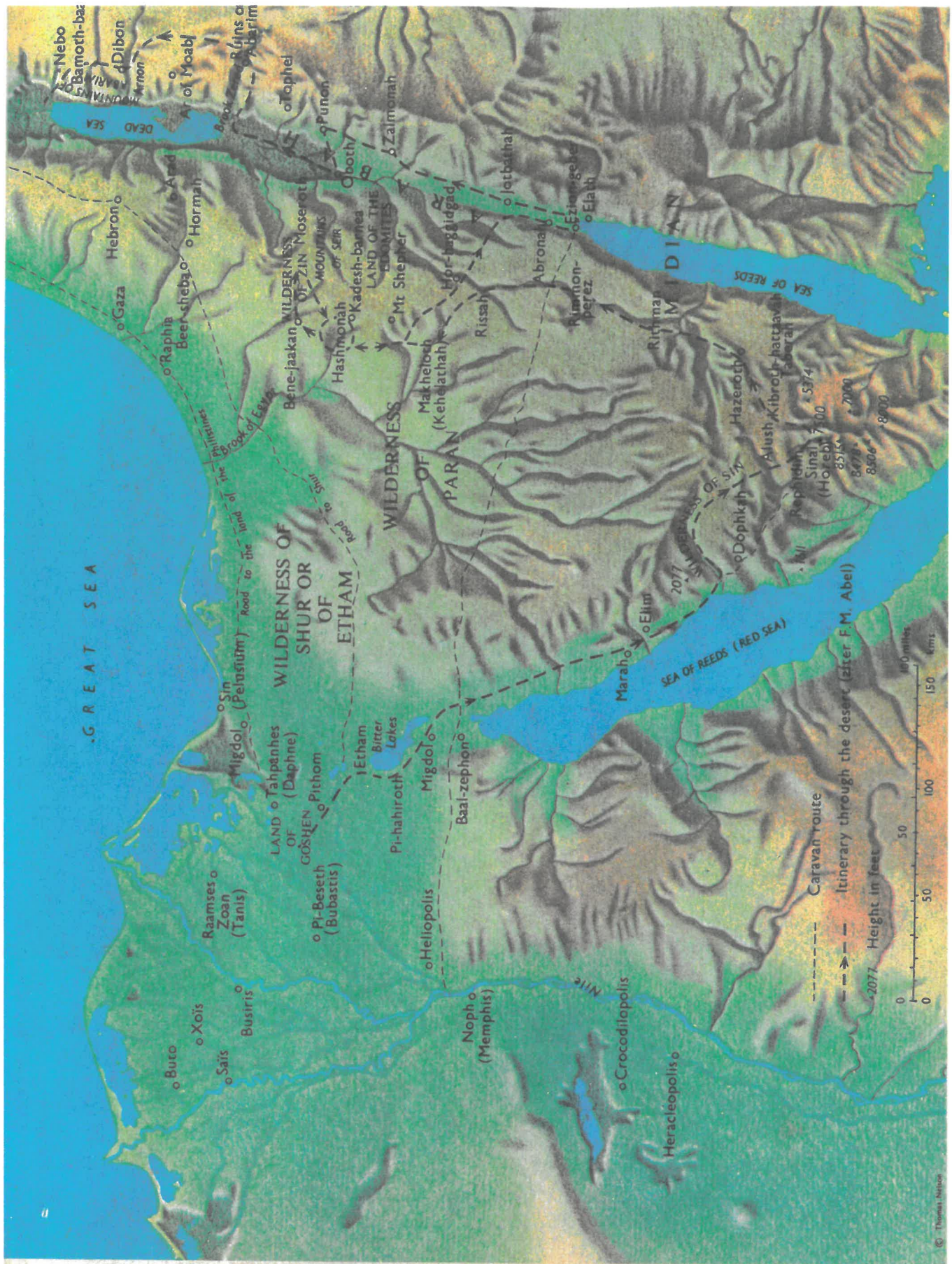
THE WANDERING IN THE WILDERNESS